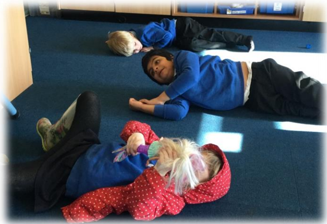
Sunbathing in the sun together.

Thank you to all the families that sent in pictures of the important people in your children's lives, we appreciate the thought and effort that went into putting them together and look forward to using them in conversation with our young people.