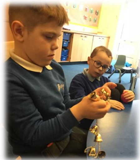
Exploring and listening to sounds.

Get some well-deserved rest this weekend after an amazing first week back,