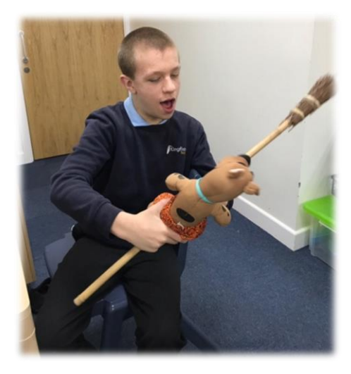
mess... but so much fun!

Numeracy has seen us working on place value this week. Some pupils have impressed, demonstrating their understanding of the value of 10s and 1s with Dienes Blocks and Pictorial Representation while others have doubled down, securing their understanding of early counting and addition during both morning activities and lessons.